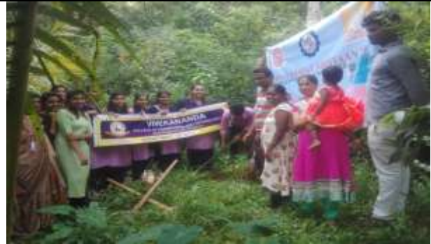
Planting the Saplings at Kodippadi village