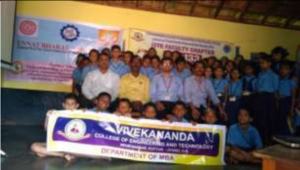
Delivered a talk session Kodipadi Govt. School