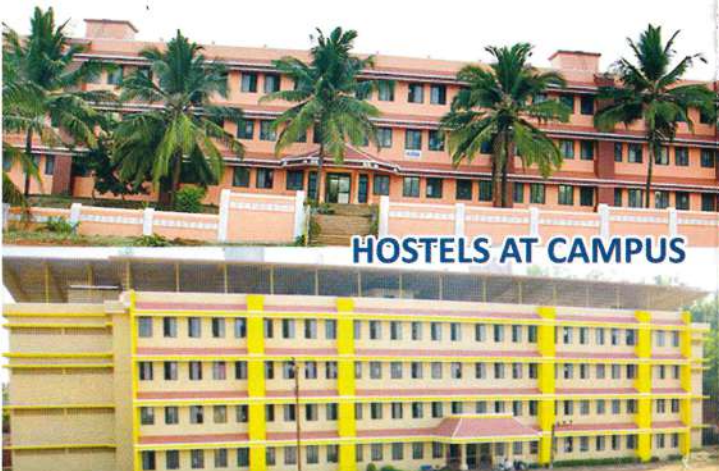
HOSTELS AT CAMPUS

"where discipline & excellence is a way of life"